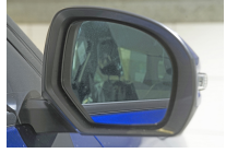
Side View Mirror