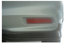
Rear Bumper Light