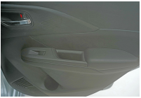
Rear Door Trim Pockets