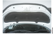
Under Bonnet Area