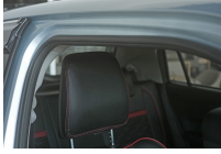
Door Weather Strip