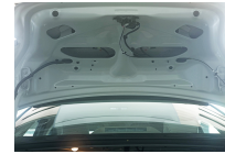
Under Area Dickey Door