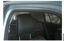
Rear Door Hinge