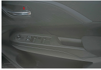
Front Door Trim Pockets