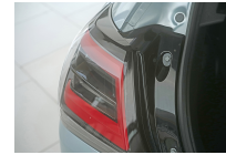
Rear Lamp Cover