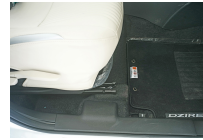
Carpet Area below Front Seat