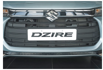
Front Grille Bumper