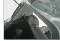
Dickey Weather Strip