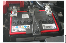
Jelly On Battery Terminals