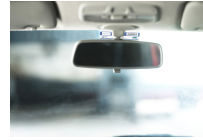
Rear View Mirror